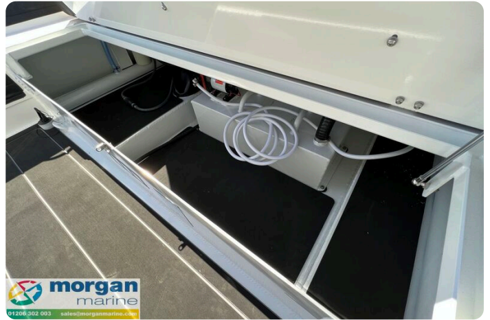
Highfield Sport 700 - storage compartment