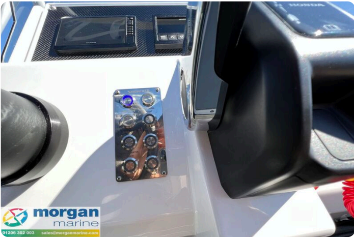
Highfield Sport 700 - switch panel