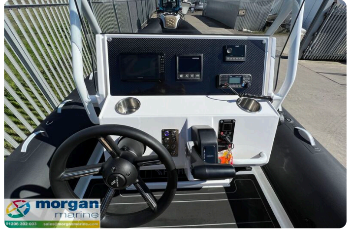
Highfield Sport 700 - engine controls