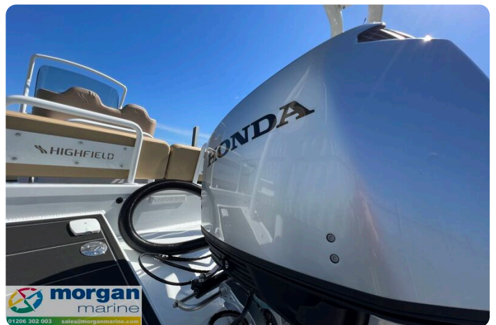
Highfield Sport 700 - Honda engine cowl