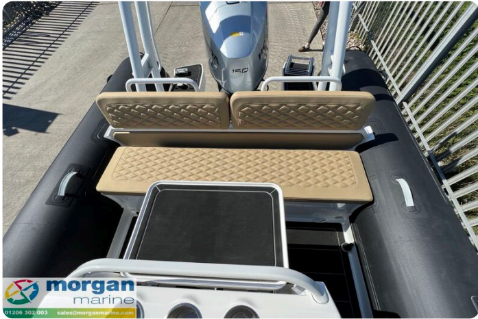
Highfield Sport 700 - folding table for aft bench