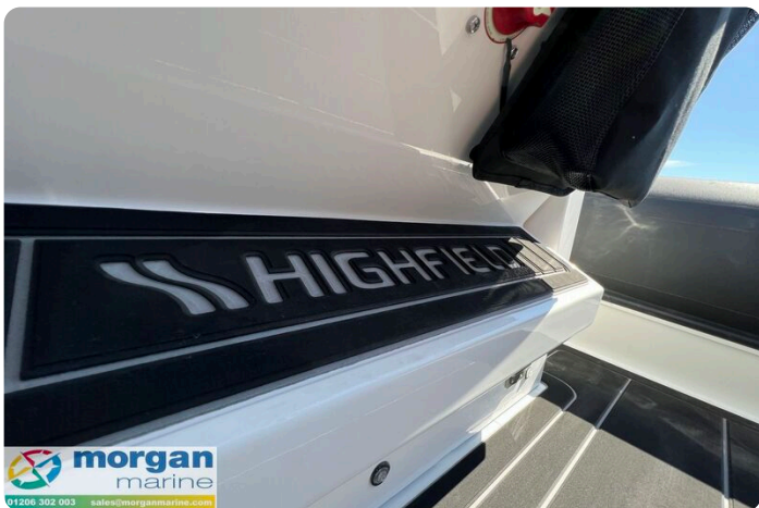
Highfield Sport 700 - decals