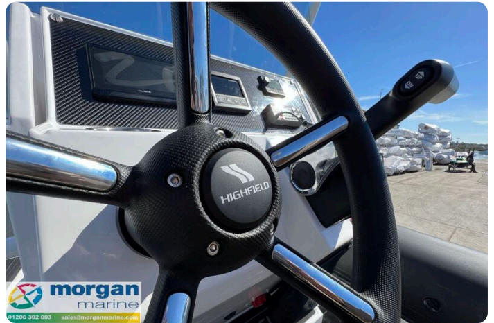
Highfield Sport 700 - steering wheel and dash