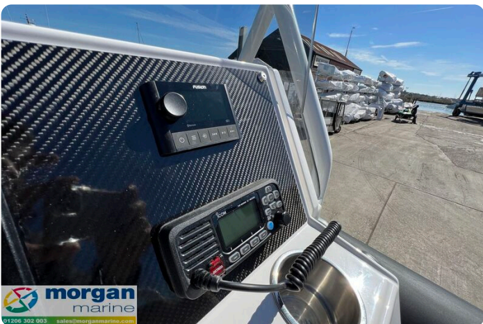
Highfield Sport 700 - VHF radio