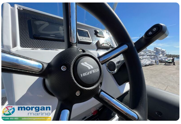
Highfield Sport 700 - steering while and dash