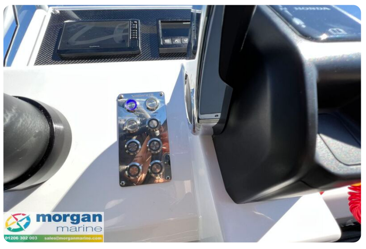
Highfield Sport 700 - switch panel