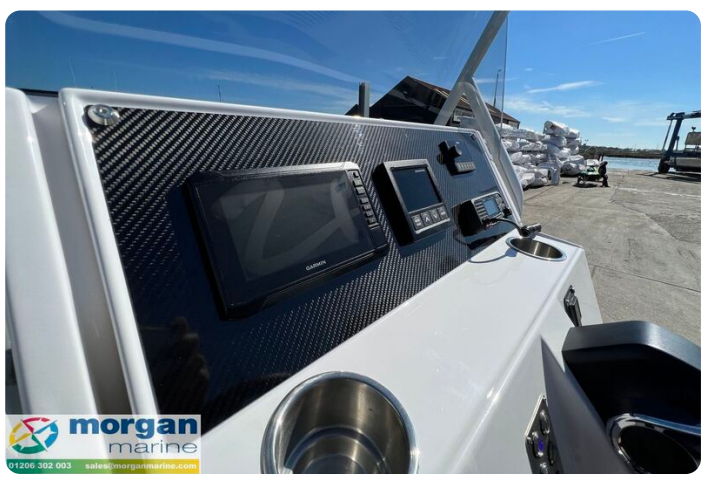
Highfield Sport 700 - display screens