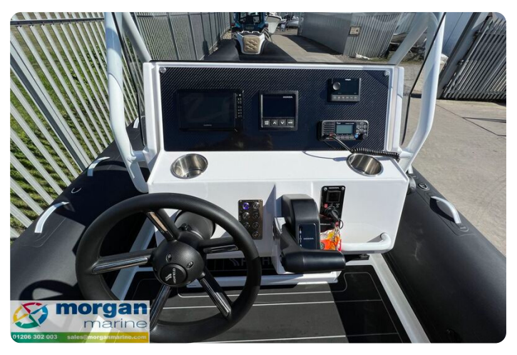
Highfield Sport 700 - engine controls