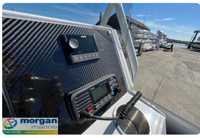
Highfield Sport 700 - VHF radio