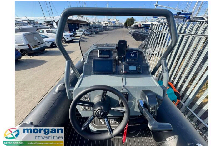
Highfield Sport 560 Hunter - dash