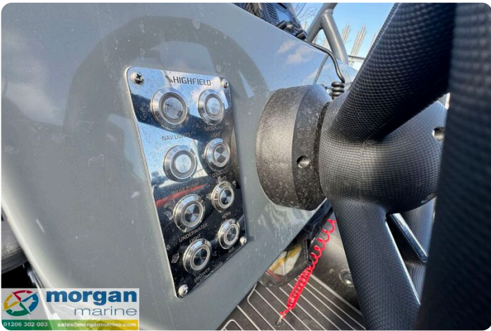
Highfield Sport 560 Hunter - controls