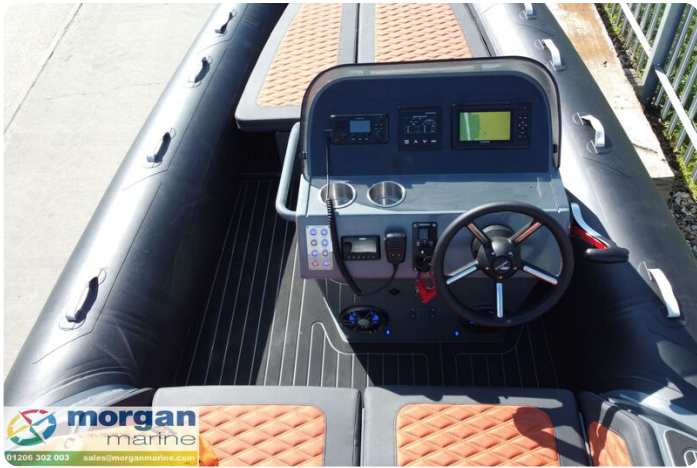
Highfield Sport 520 aluminium RIB - console and dash