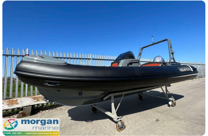
Highfield Sport 520 aluminium RIB - port side tubes