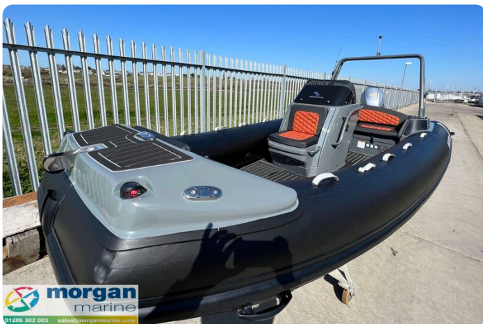
Highfield Sport 520 aluminium RIB - bow locker