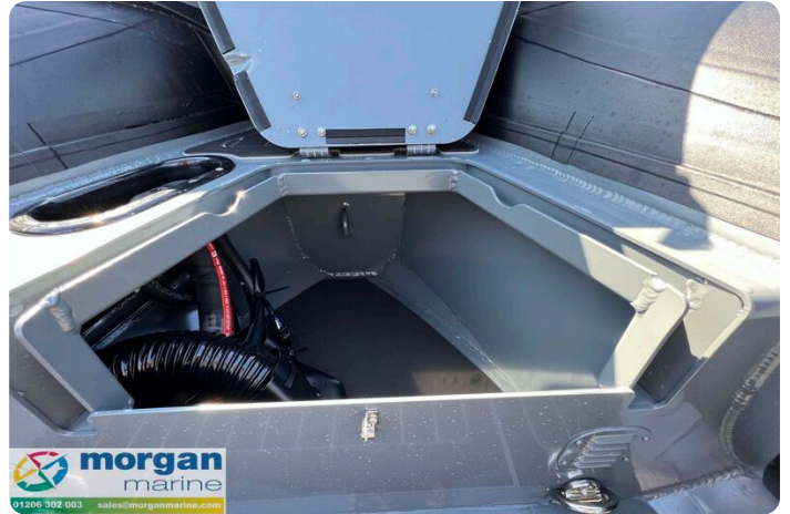
Highfield Sport 520 aluminium RIB - storage locker