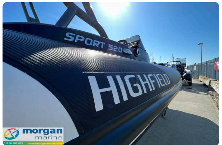
Highfield Sport 520 aluminium RIB - decals