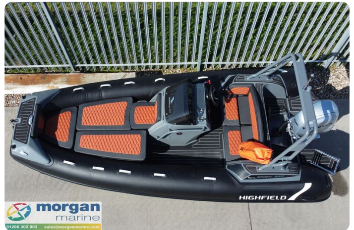
Highfield Sport 520 aluminium RIB - overhead view with cushions