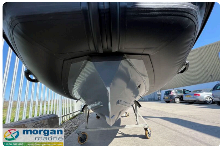
Highfield Sport 520 aluminium RIB - hull