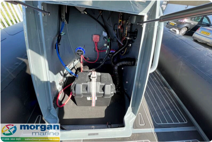
Highfield Sport 520 aluminium RIB - storage in console