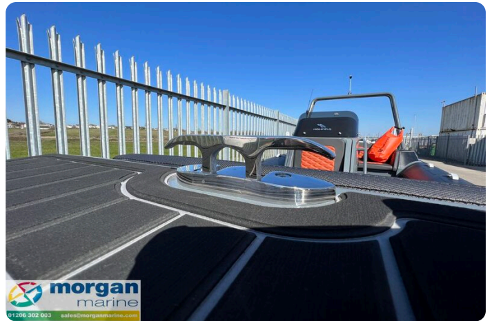
Highfield Sport 520 aluminium RIB - cleat