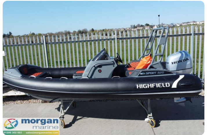
Highfield Sport 520 aluminium RIB - port side view