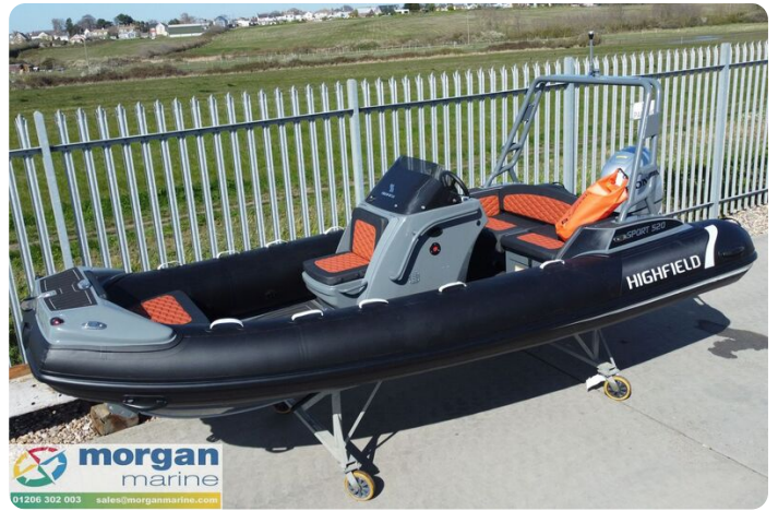
Highfield Sport 520 aluminium RIB - view from port side bow