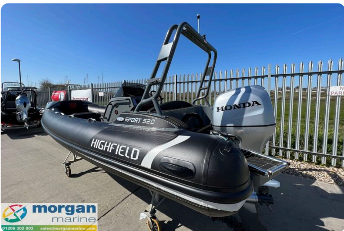
Highfield Sport 520 aluminium RIB - view from port side aft