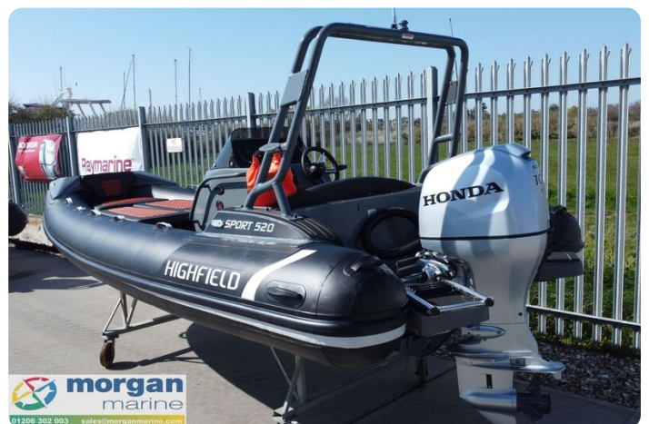
Highfield Sport 520 aluminium RIB - A-frame