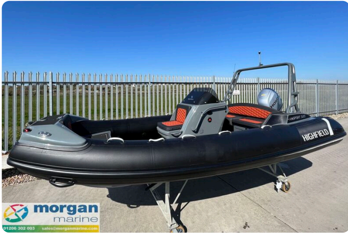
Highfield Sport 520 aluminium RIB