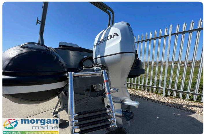
Highfield Sport 520 aluminium RIB - Honda BF100 outboard engine