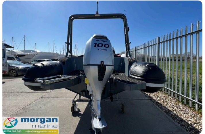
Highfield Sport 520 aluminium RIB - transom and engine