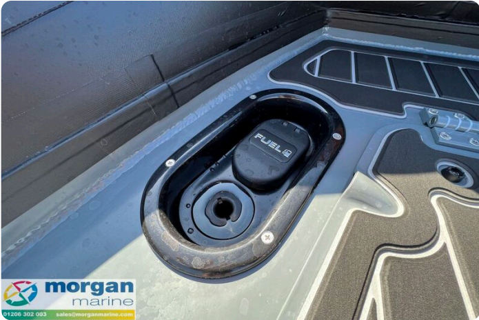
Highfield Sport 520 aluminium RIB - fuel fill