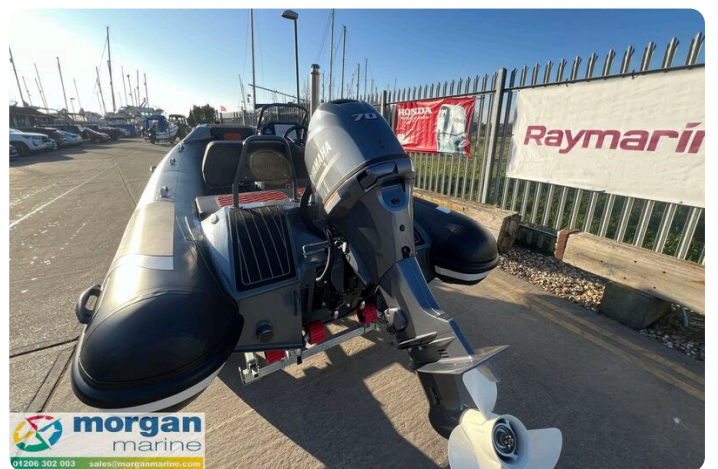
Highfield Sport 420 - engine