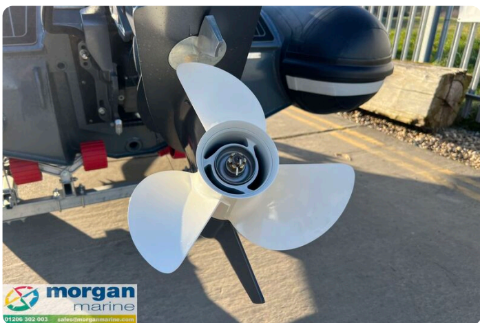
Highfield Sport 420 - prop