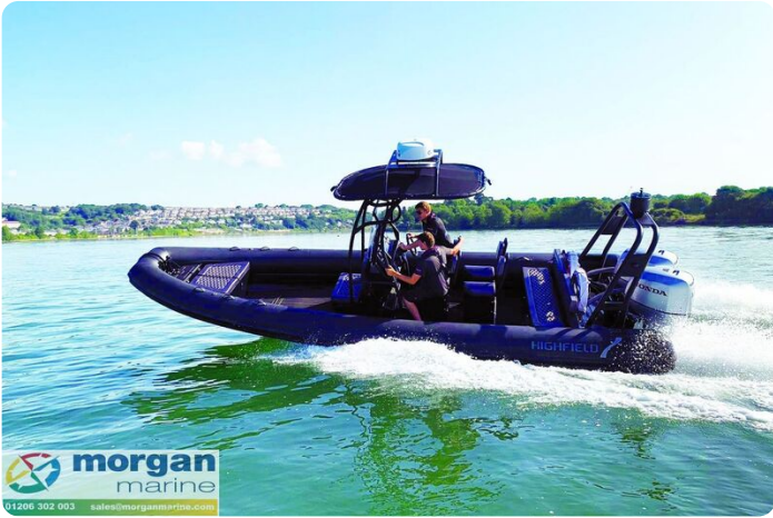
Highfield Patrol 860 aluminium RIB