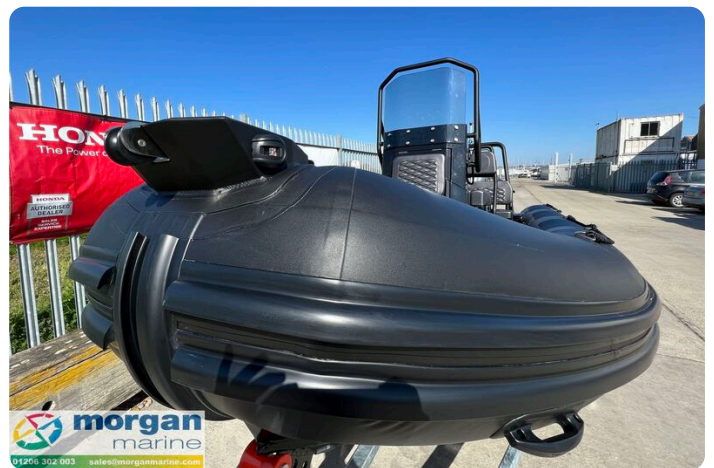
Highfield Patrol 500 aluminium RIB - bow and tubes