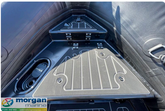
Highfield Patrol 500 aluminium RIB - bow cushion