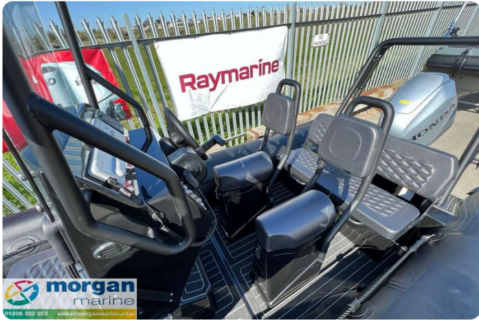
Highfield Patrol 500 aluminium RIB - overhead view of jockey seats