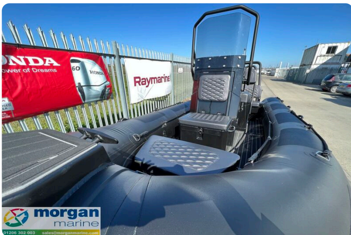
Highfield Patrol 500 aluminium RIB - tubes and bow seating