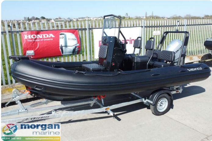
Highfield Patrol 500 aluminium RIB