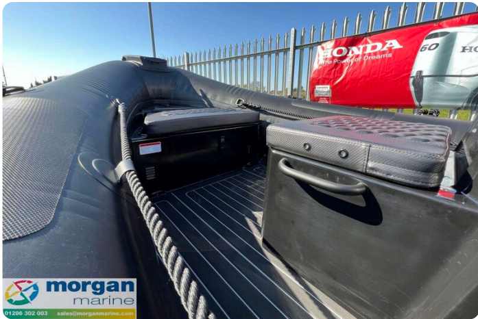
Highfield Patrol 500 aluminium RIB - flooring in bow