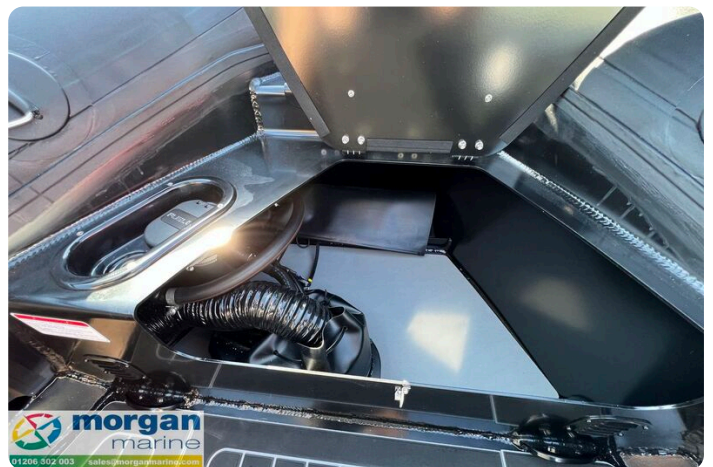
Highfield Patrol 500 aluminium RIB - bow locker