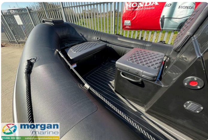
Highfield Patrol 500 aluminium RIB - bow seating