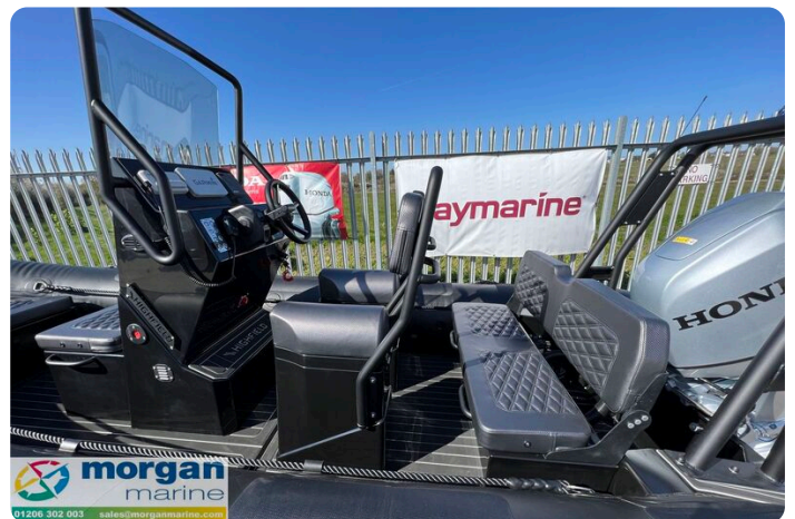
Highfield Patrol 500 aluminium RIB - jockey seats and aft bench seat