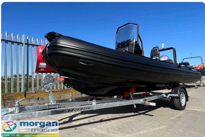
Highfield Patrol 500 aluminium RIB - under bow and hull