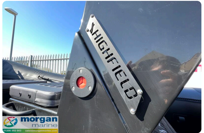
Highfield Patrol 500 aluminium RIB - decal