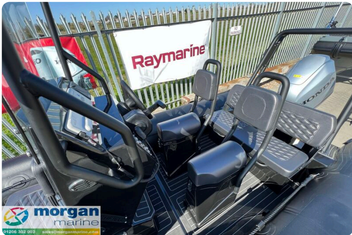
Highfield Patrol 500 aluminium RIB - overhead view of jockey seats