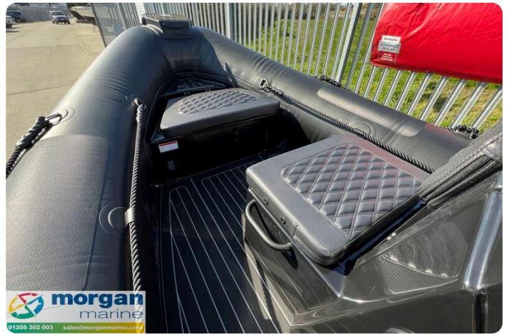
Highfield Patrol 500 aluminium RIB - forward console seat