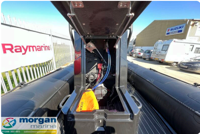
Highfield Patrol 500 aluminium RIB - storage in console