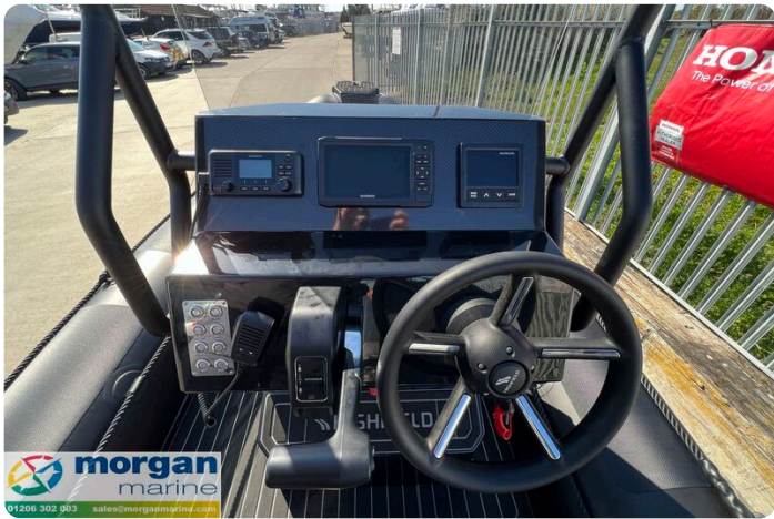
Highfield Patrol 500 aluminium RIB - steering wheel and dash