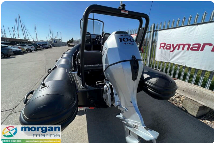
Highfield Patrol 500 aluminium RIB - Honda BF100 outboard