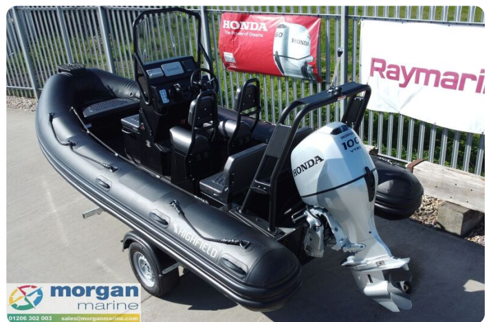
Highfield Patrol 500 aluminium RIB - aft port side with Honda outboard