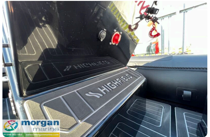
Highfield Patrol 500 aluminium RIB - deck