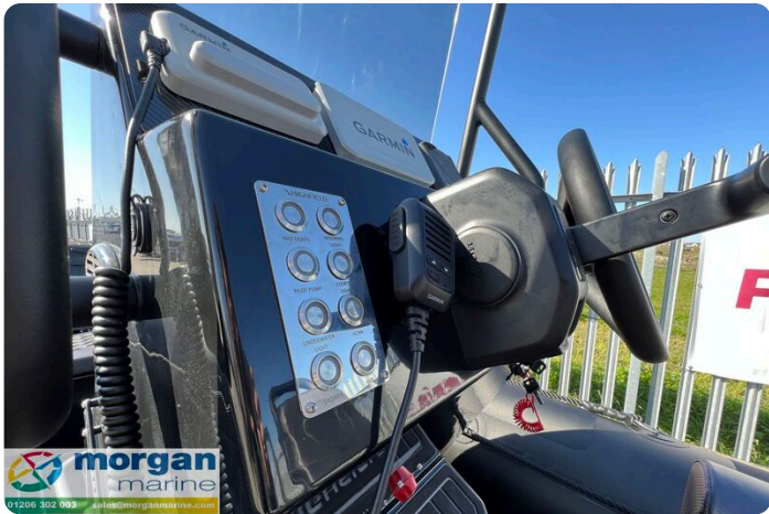
Highfield Patrol 500 aluminium RIB - switch panel