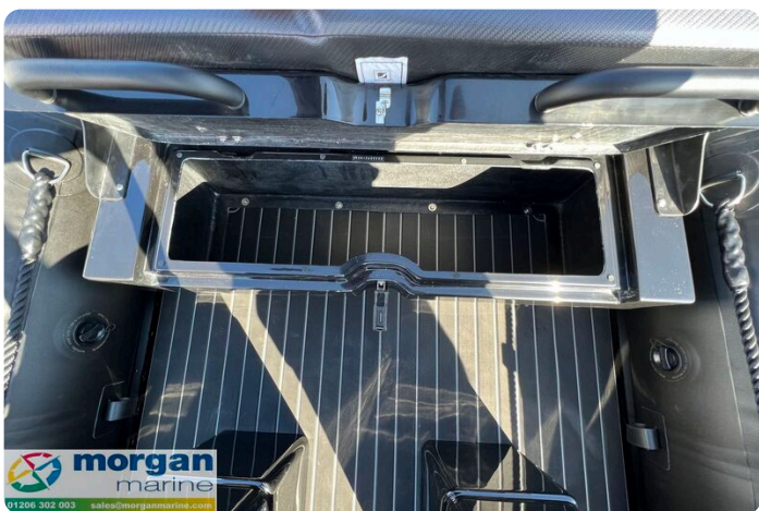
Highfield Patrol 500 aluminium RIB - deck and locker