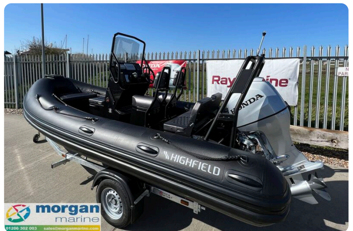
Highfield Patrol 500 aluminium RIB - A-frame