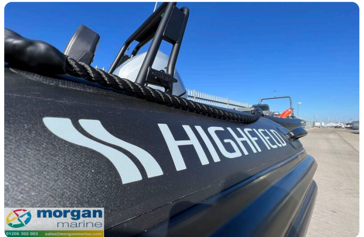
Highfield Patrol 500 aluminium RIB - decal on tube