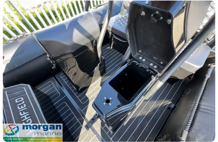
Highfield Patrol 500 aluminium RIB - storage locker