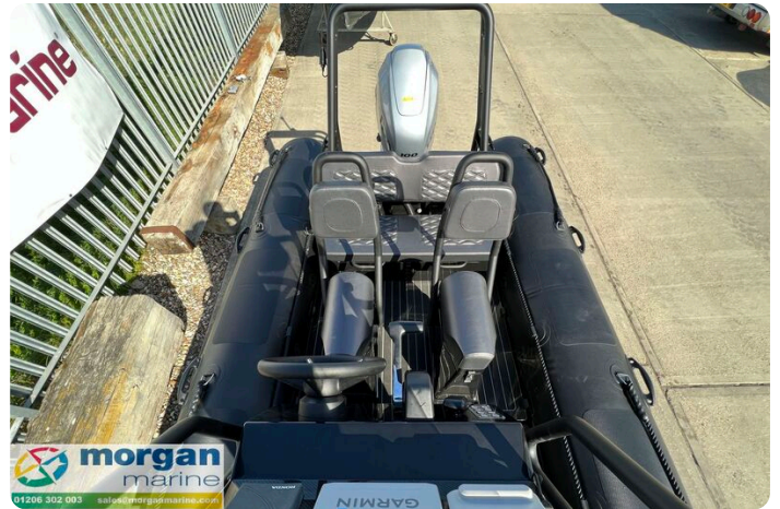
Highfield Patrol 500 aluminium RIB - overhead view from console to aft