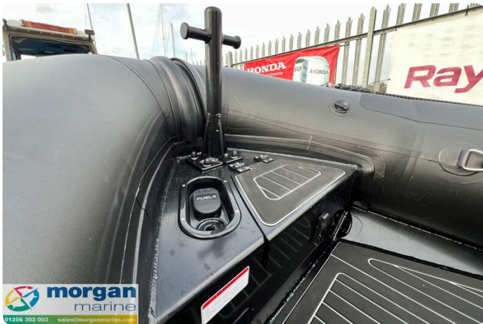
Highfield Patrol 460 black - tow post