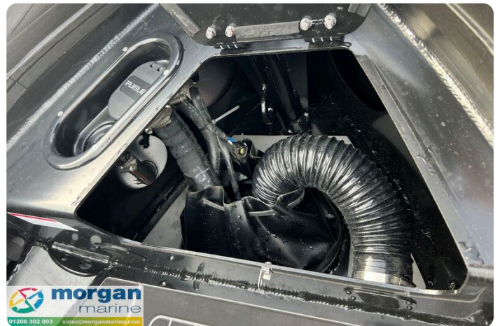
Highfield Patrol 460 black - locker bow