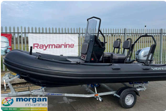
Highfield Patrol 460 black - main