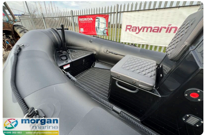
Highfield Patrol 460 black - front seat