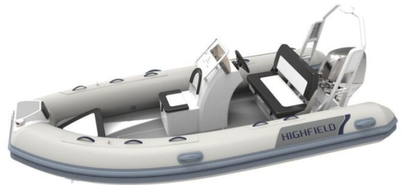
Highfield Classic 420 aluminium RIB - overview from port side