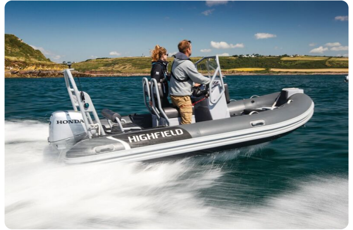
Highfield Classic 420 aluminium RIB - on the water