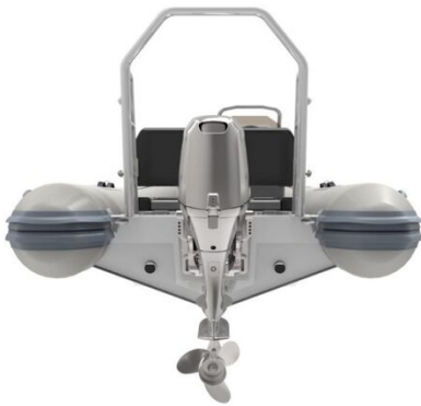
Highfield Classic 420 aluminium RIB - transom