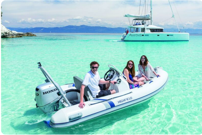
Highfield Classic 420 aluminium RIB