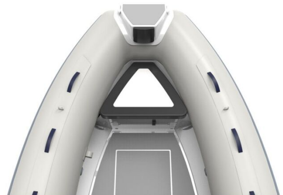
Highfield Classic 420 aluminium RIB - bow