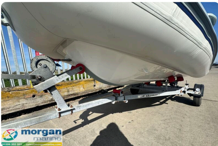
Highfield Classic 380 FCT - hull