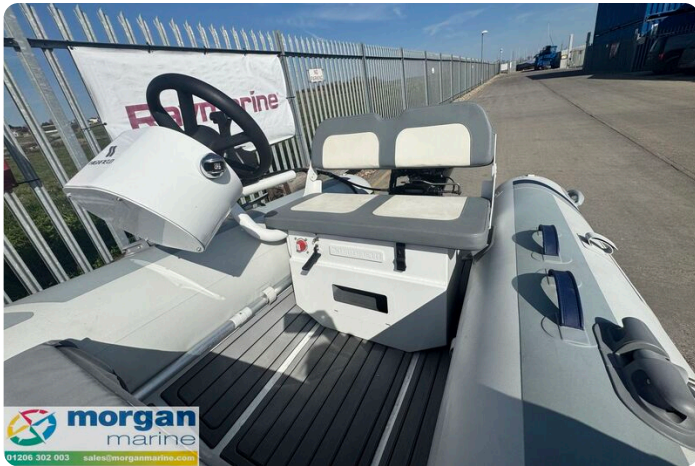
Highfield Classic 380 FCT - seating