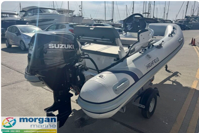
Highfield Classic 380 FCT - handles