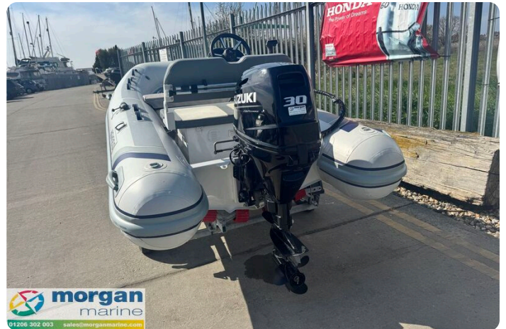
Highfield Classic 380 FCT - Suzuki