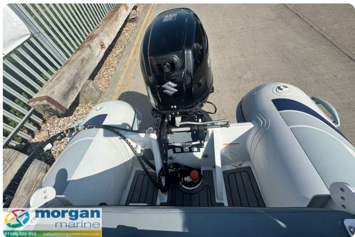
Highfield Classic 380 FCT - back of engine