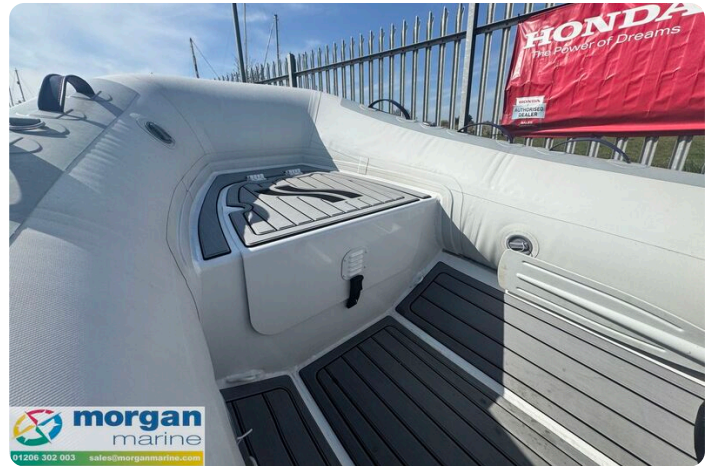
Highfield Classic 380 FCT - bow storage