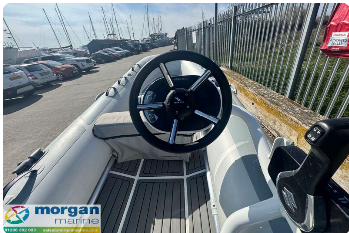
Highfield Classic 380 FCT - controls