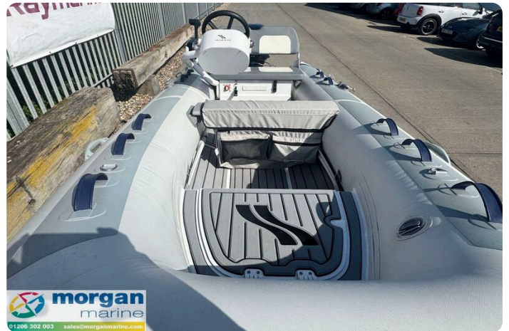
Highfield Classic 380 FCT - overview