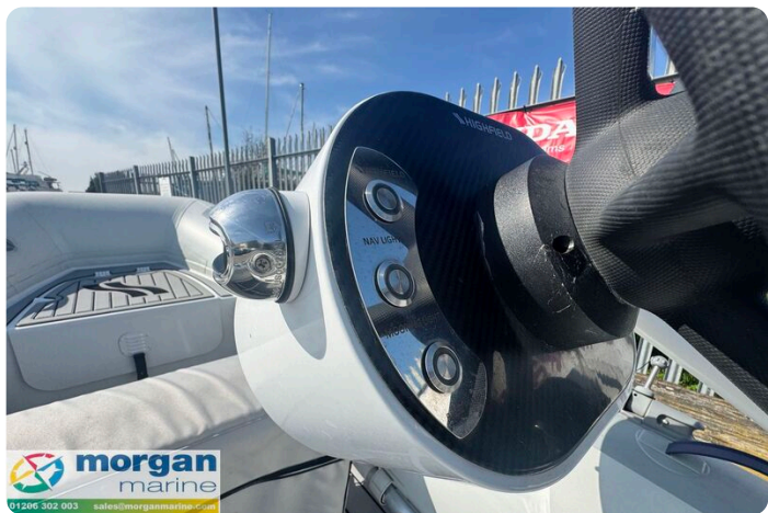
Highfield Classic 380 FCT - switch panel