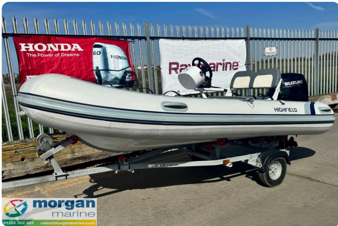
Highfield Classic 380 FCT - main