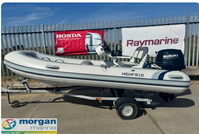
Highfield Classic 380 FCT - side