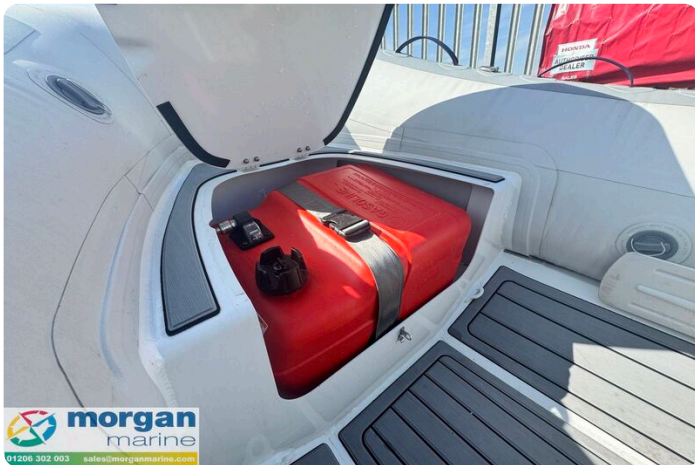
Highfield Classic 380 FCT - fuel tank