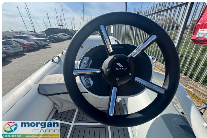
Highfield Classic 380 FCT - wheel