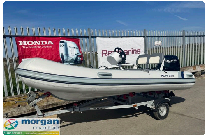
Highfield Classic 380 FCT - grab handles