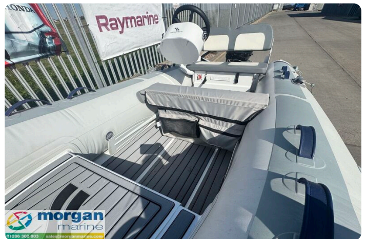
Highfield Classic 380 FCT - deck