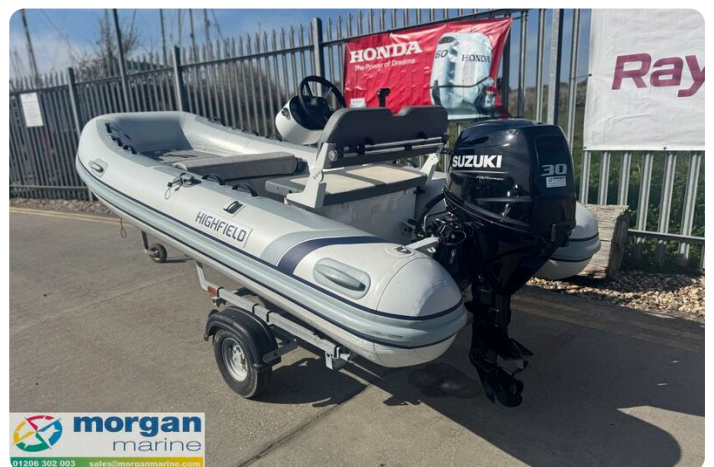
Highfield Classic 380 FCT - back