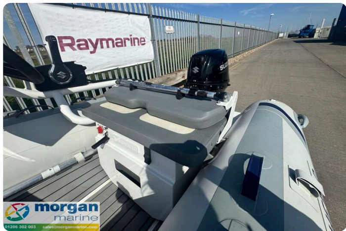
Highfield Classic 380 FCT - seat