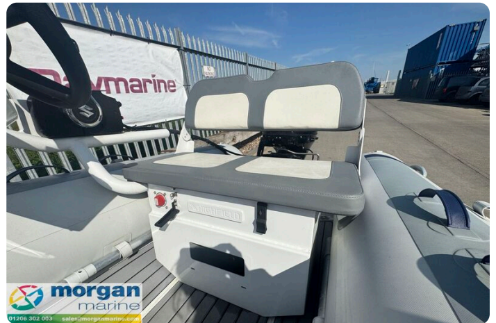
Highfield Classic 380 FCT - console seating