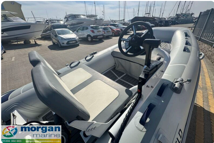
Highfield Classic 380 FCT - dash