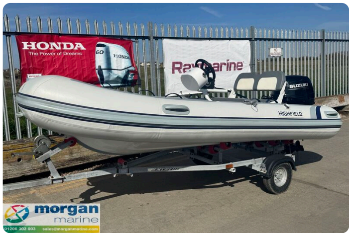
Highfield Classic 380 FCT - side view