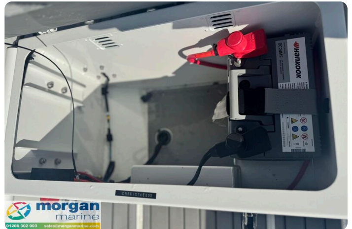
Highfield Classic 380 FCT - battery