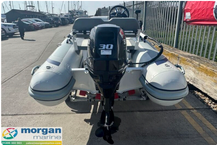
Highfield Classic 380 FCT - engine