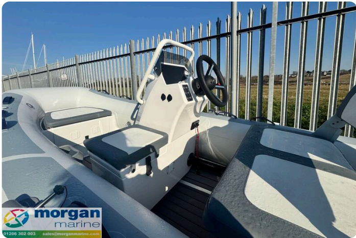
Highfield Classic 380 GT console - console