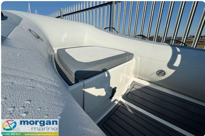
Highfield Classic 380 GT console - bow seat