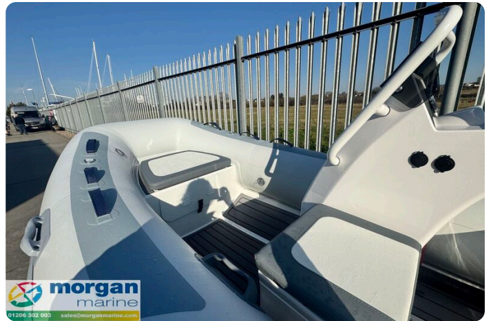
Highfield Classic 380 GT console - bow seating