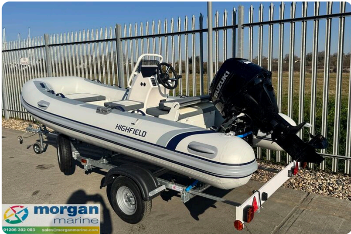
Highfield Classic 380 GT console - back