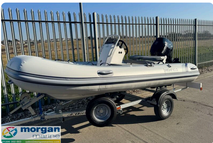
Highfield Classic 380 GT console - side