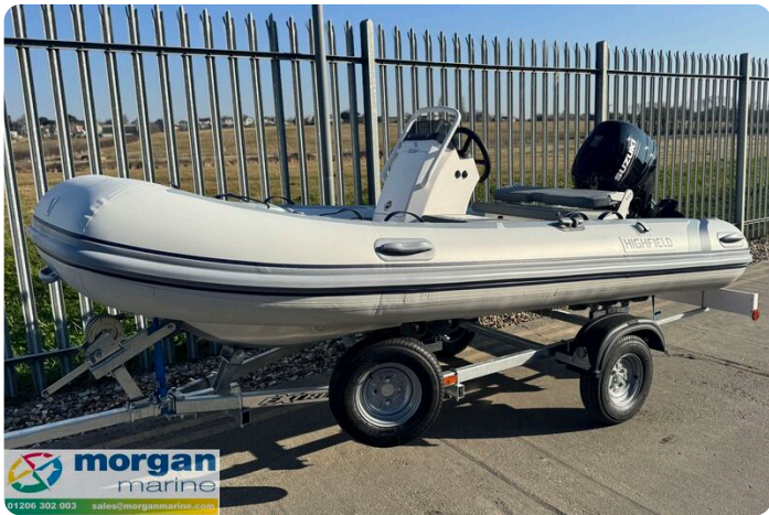
Highfield Classic 380 GT console - Main