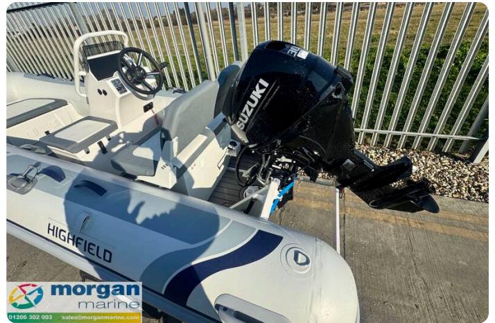
Highfield Classic 380 GT console - engine