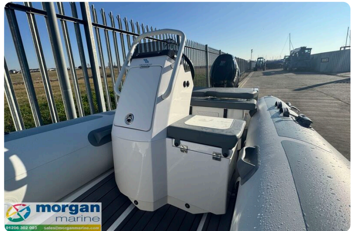
Highfield Classic 380 GT console - GT Console