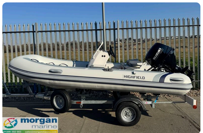
Highfield Classic 380 GT console - side view