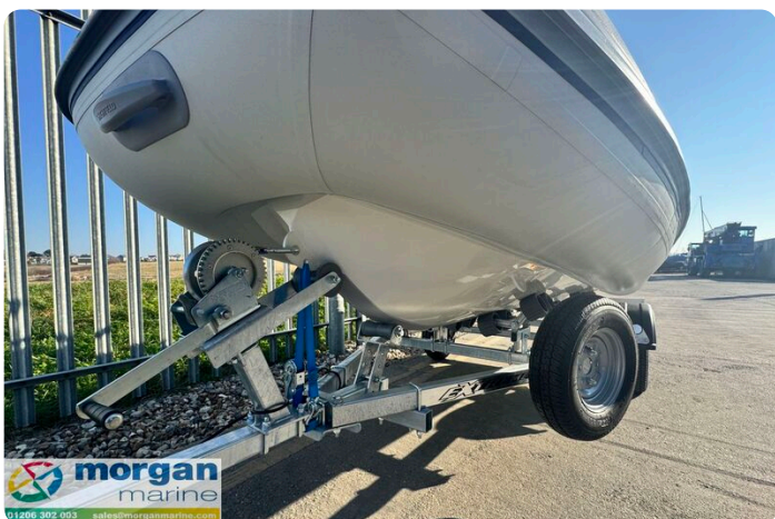
Highfield Classic 380 GT console - bow