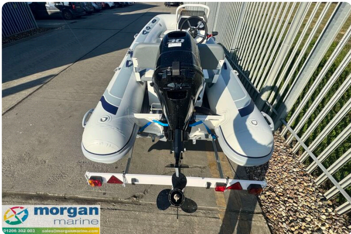
Highfield Classic 380 GT console - prop