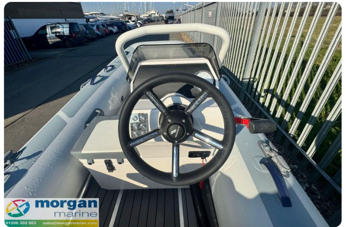
Highfield Classic 380 GT console - Wheel