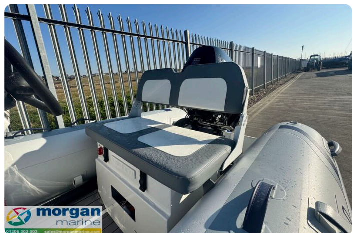
Highfield Classic 380 GT console - seating