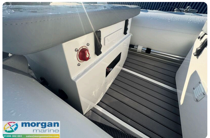
Highfield Classic 380 GT console - isolator