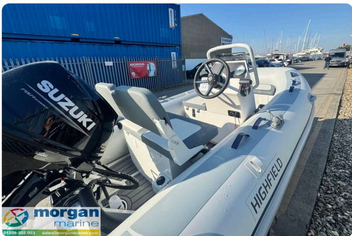
Highfield Classic 380 GT console - back