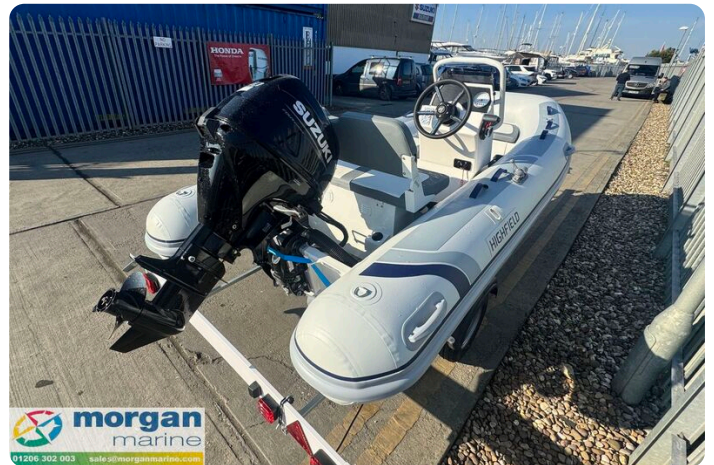
Highfield Classic 380 GT console - handle