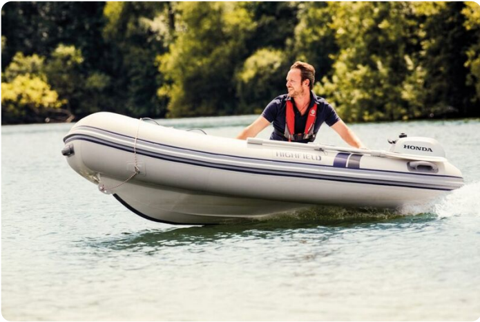
Highfield CL 310 - on the water