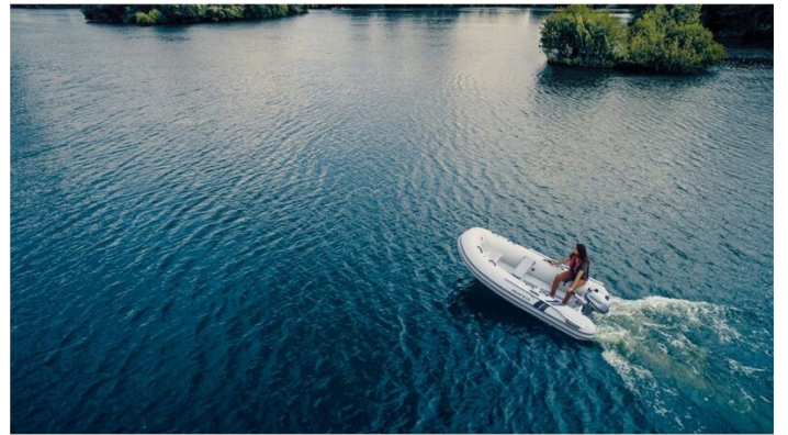
Highfield CL 310 - overhead view