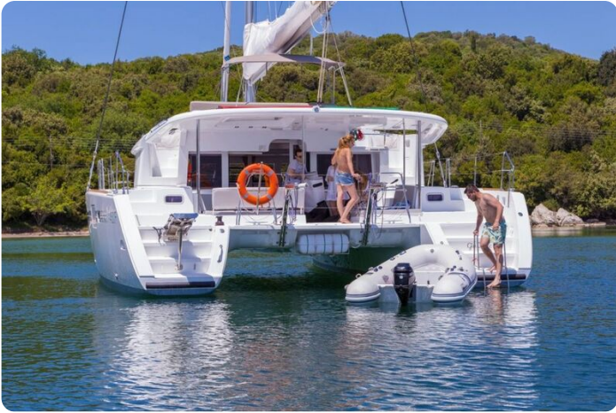
Highfield CL 310 - lifted off larger boat