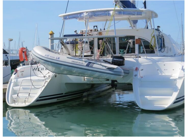
Highfield CL 310 - lifted into water