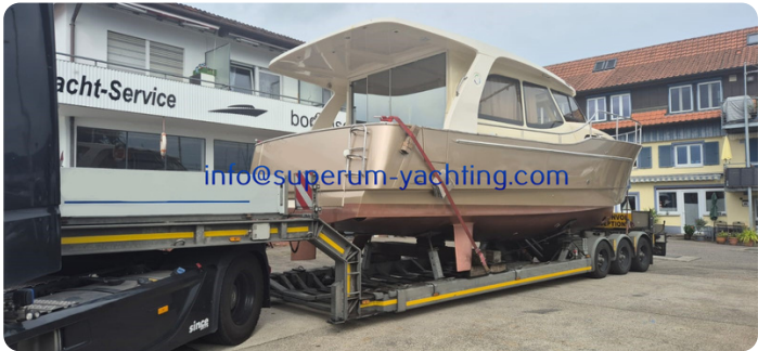
WhatsApp Image 2024-07-12 at 10.08.26