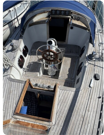
Phantom 35 TOWANDA 18