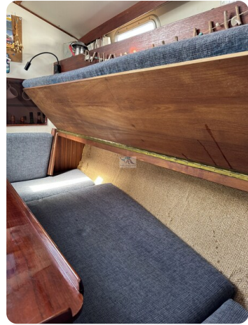
Phantom 35 TOWANDA 75