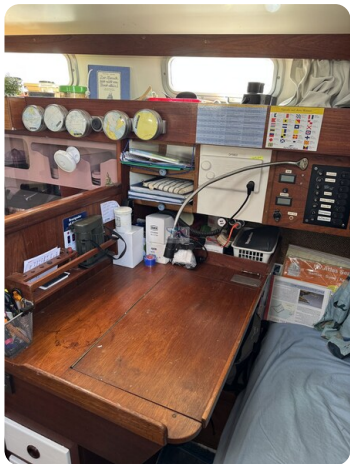
Phantom 35 TOWANDA 50