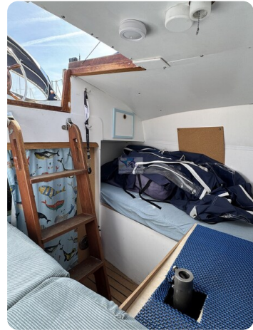
Phantom 35 TOWANDA 10