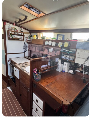
Phantom 35 TOWANDA 61