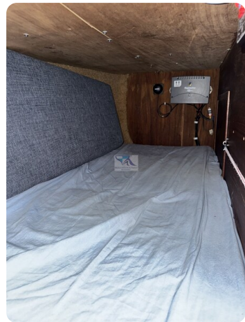
Phantom 35 TOWANDA 51