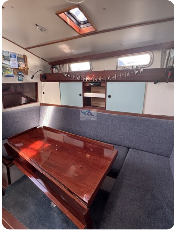
Phantom 35 TOWANDA 47