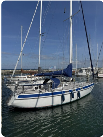
Phantom 35 TOWANDA 105