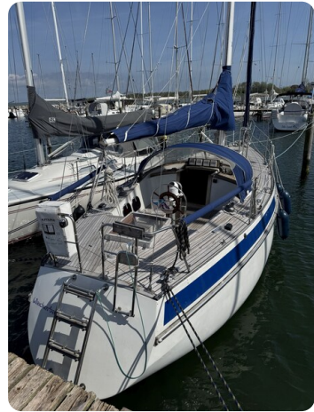
Phantom 35 TOWANDA 104