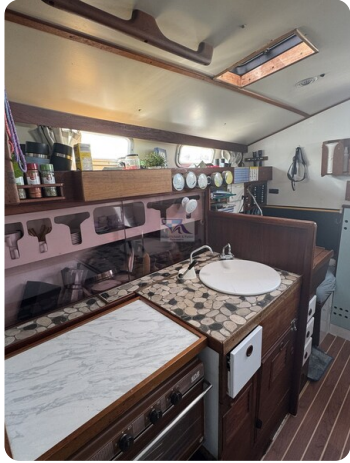
Phantom 35 TOWANDA 49