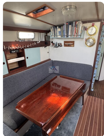
Phantom 35 TOWANDA 60