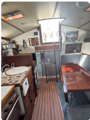
Phantom 35 TOWANDA 48