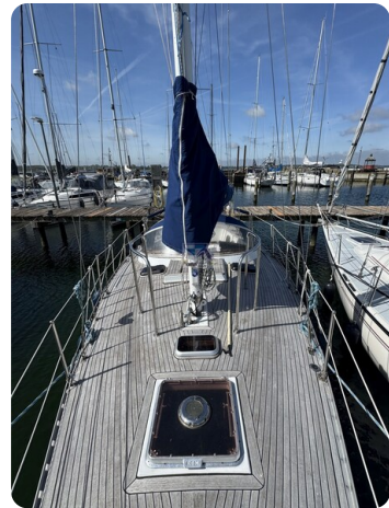
Phantom 35 TOWANDA 31