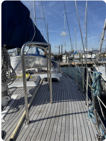
Phantom 35 TOWANDA 33