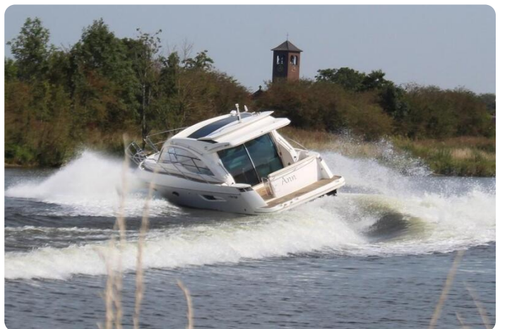
Galeon 390 HT