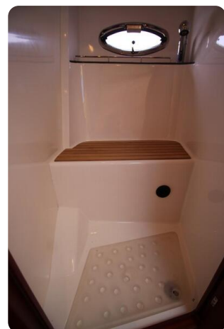
Galeon 390 HT