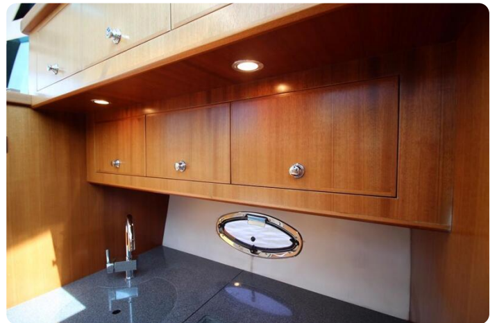
Galeon 390 HT