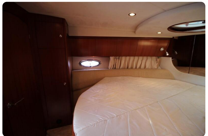
Galeon 390 HT