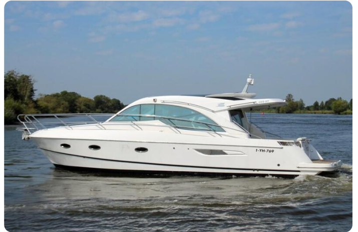
Galeon 390 HT