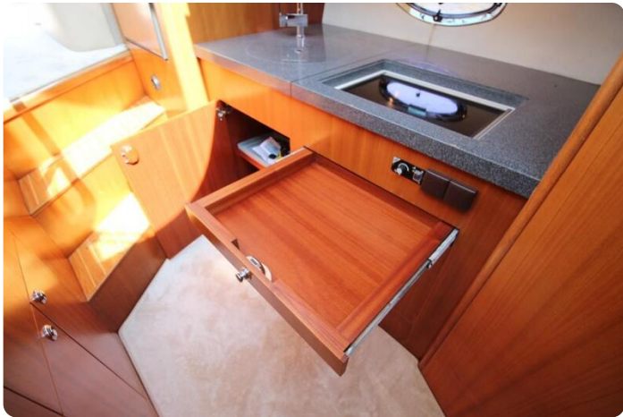
Galeon 390 HT