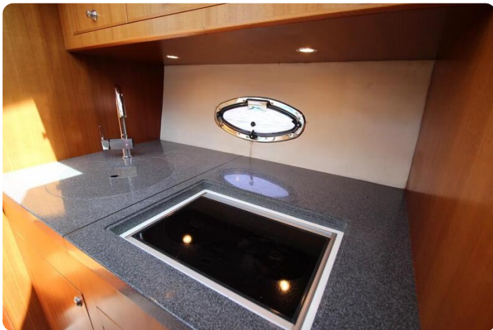
Galeon 390 HT