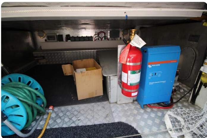
Galeon 390 HT