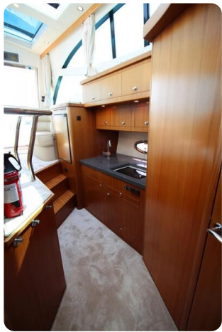
Galeon 390 HT