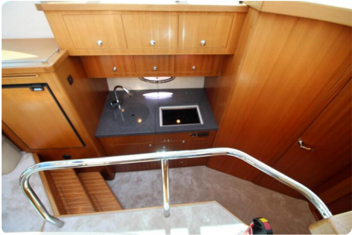
Galeon 390 HT