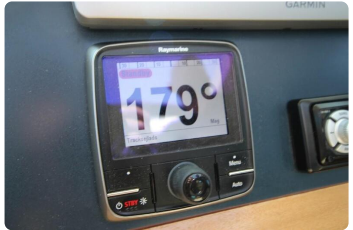
Galeon 390 HT