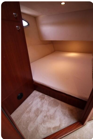
Galeon 390 HT