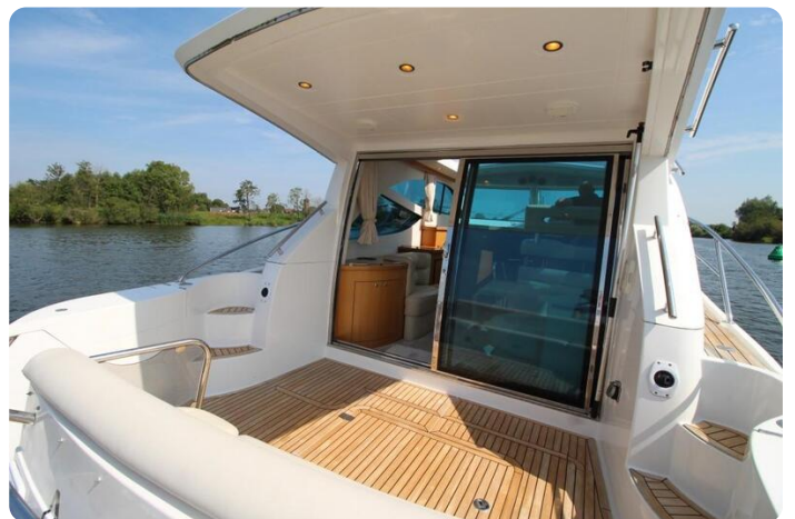
Galeon 390 HT