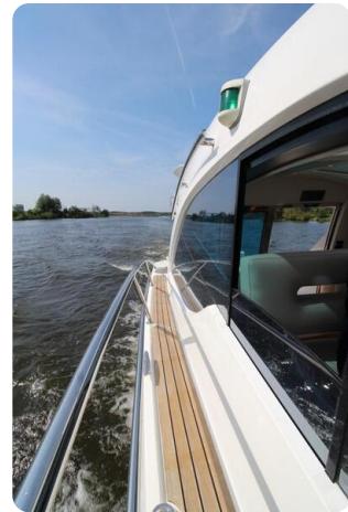
Galeon 390 HT