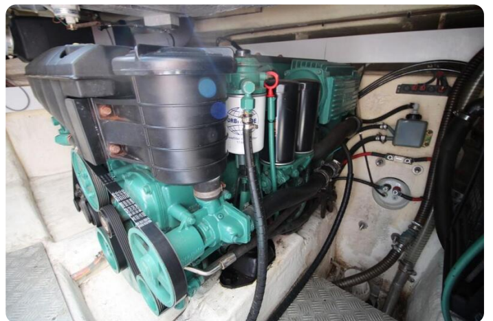
Galeon 390 HT