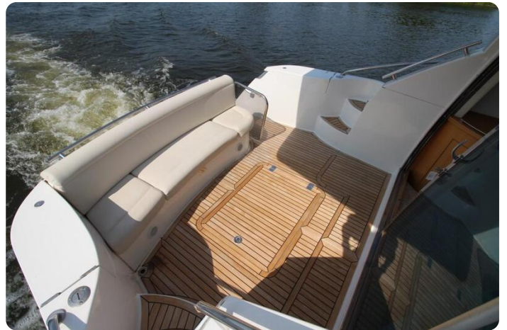
Galeon 390 HT