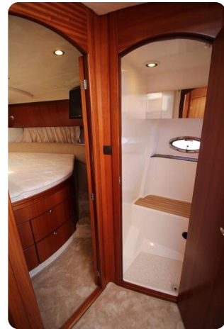
Galeon 390 HT