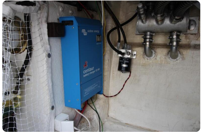
Galeon 390 HT