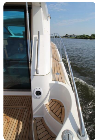
Galeon 390 HT