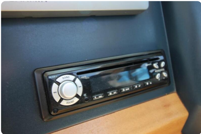
Galeon 390 HT