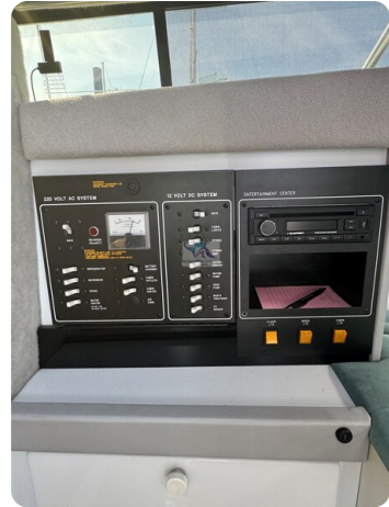
Formula BALU 52