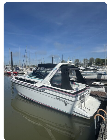
Formula BALU 33