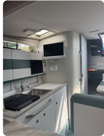
Formula BALU 60