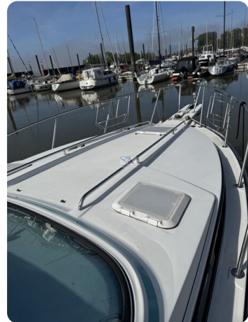
Formula BALU 78