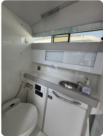
Formula BALU 48