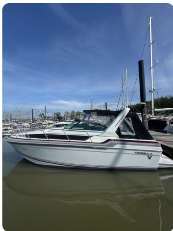
Formula BALU 74