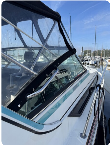
Formula BALU 79