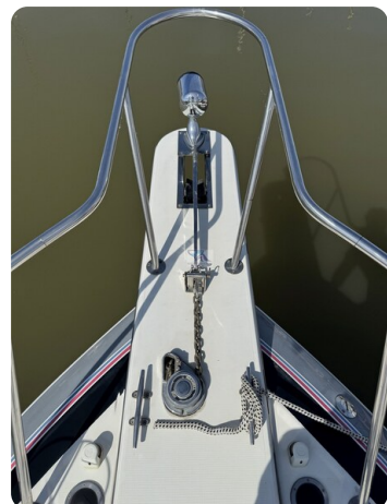
Formula BALU 8