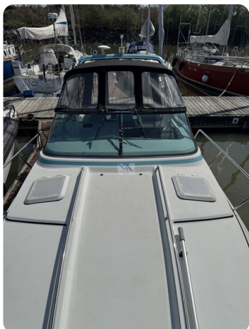
Formula BALU 5