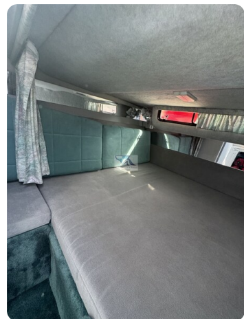
Formula BALU 58