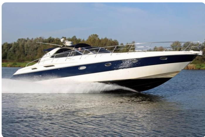
Cranchi Mediterrané 50