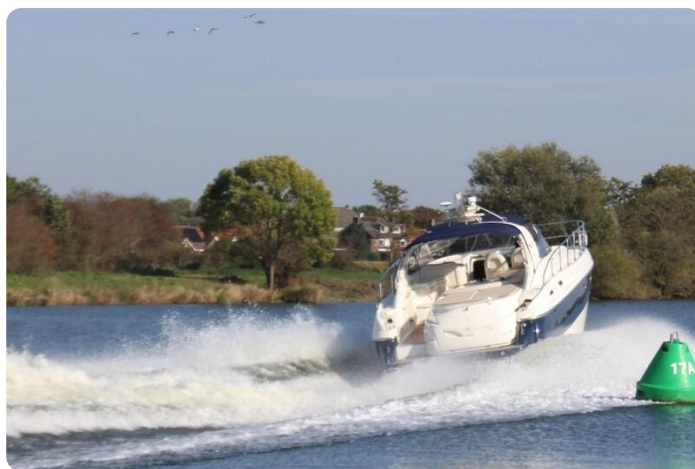
Cranchi Mediterrané 50