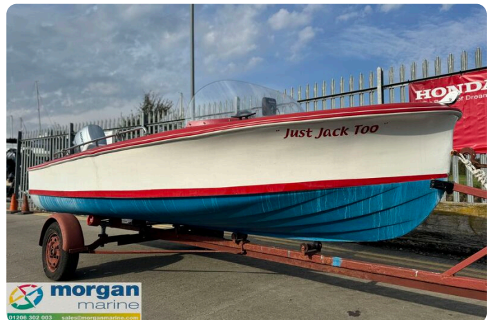
Classic mid-1970s river launch-main