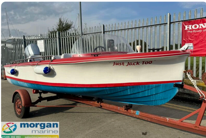
Classic mid-1970s river launch-side