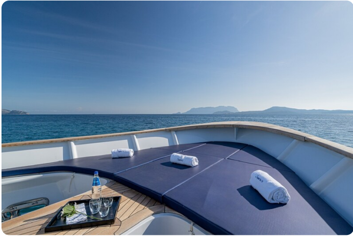
Aquarius IV Bow Sunpad