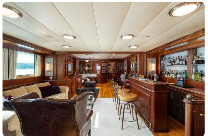
Aquarius IV Living Fwd View