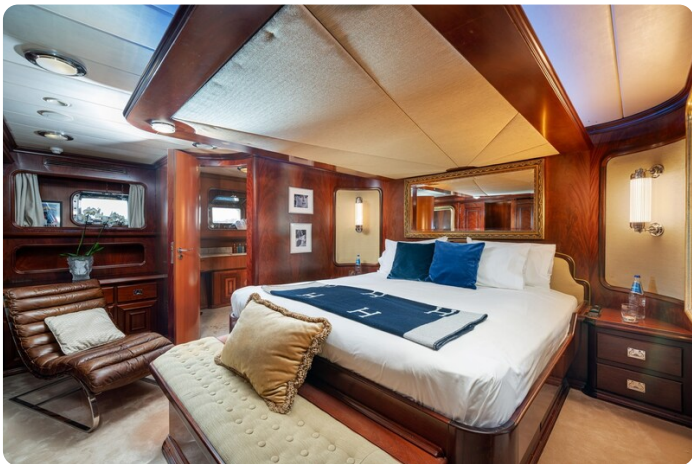
Aquarius IV Master Cabin