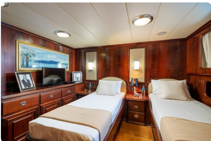
Aquarius IV 1st Twin Guests Cabin