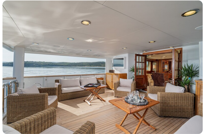
Aquarius IV Stern Dinette