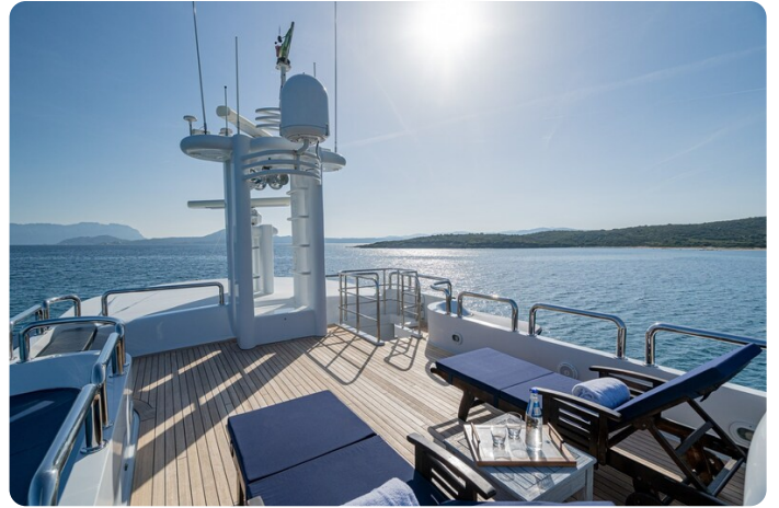
Aquarius IV Fly