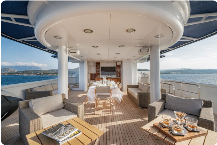
Aquarius IV Main Deck Dinette