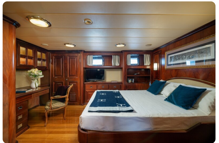
Aquarius IV VIP Stateroom