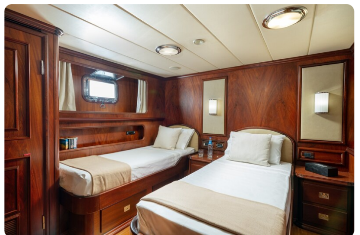
Aquarius IV 2nd Twin Guests Cabin