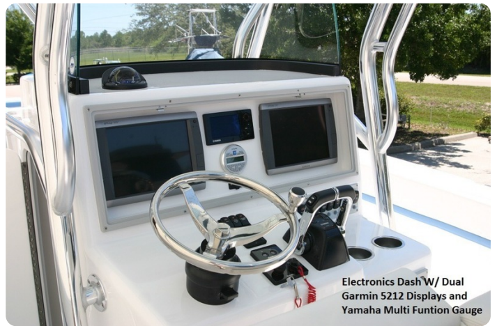
Electronics Dash W/ Dual Garmin 5212 Displays and Yamaha Multi Funtion Gauge