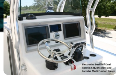
Electronics Dash w/ Dual Garmin 5212 Displays and Yamaha Multi Function Gauge