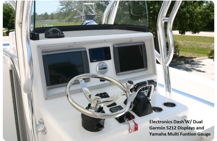
Electronics Dash W/ Dual Garmin 5212 Displays and Yamaha Multi Functon Gauge