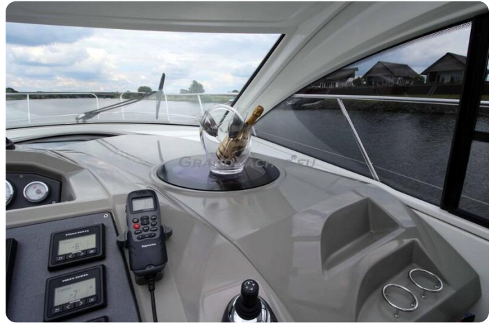
Beneteau Gran Turismo 38