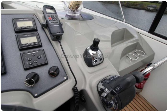
Beneteau Gran Turismo 38