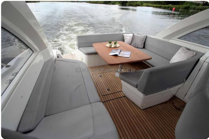
Beneteau Gran Turismo 38