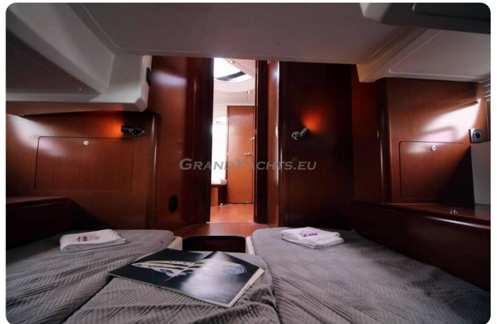
Beneteau Gran Turismo 38