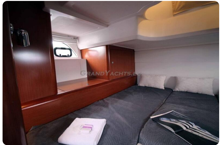
Beneteau Gran Turismo 38