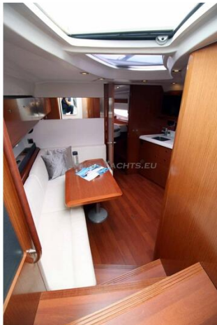
Beneteau Gran Turismo 38