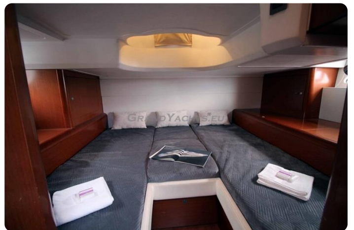
Beneteau Gran Turismo 38