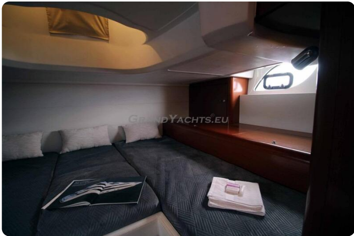
Beneteau Gran Turismo 38