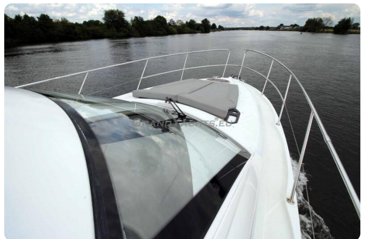
Beneteau Gran Turismo 38