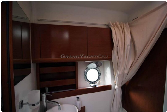
Beneteau Gran Turismo 38