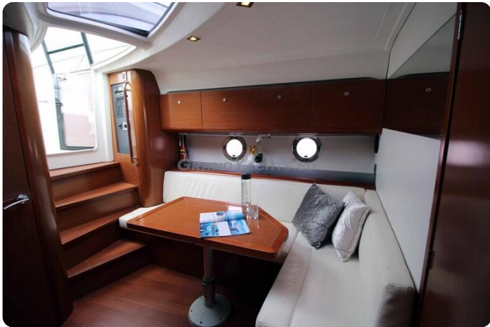
Beneteau Gran Turismo 38