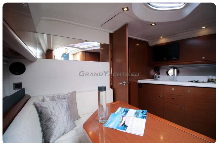
Beneteau Gran Turismo 38