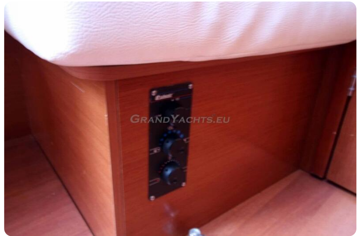
Beneteau Gran Turismo 38