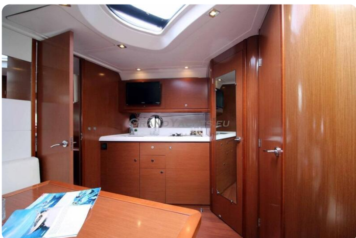
Beneteau Gran Turismo 38