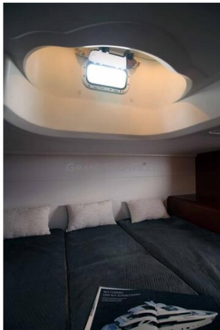
Beneteau Gran Turismo 38