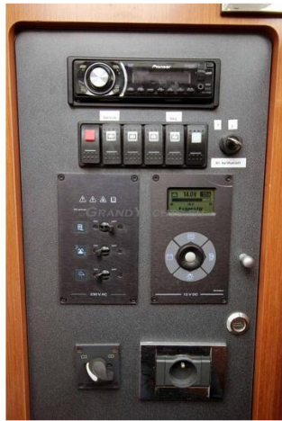
Beneteau Gran Turismo 38