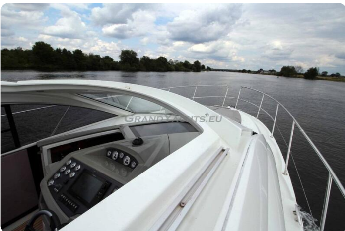
Beneteau Gran Turismo 38