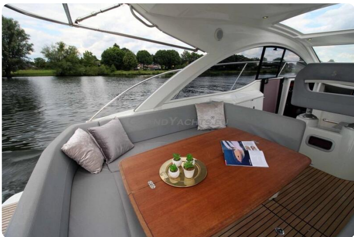
Beneteau Gran Turismo 38