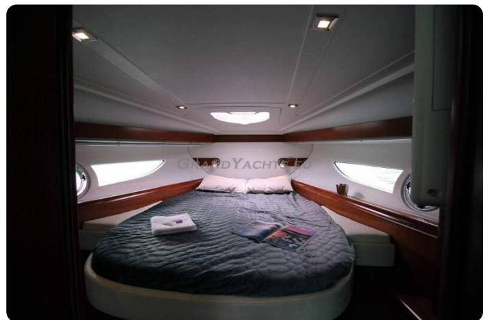
Beneteau Gran Turismo 38