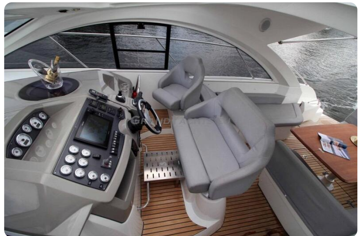
Beneteau Gran Turismo 38