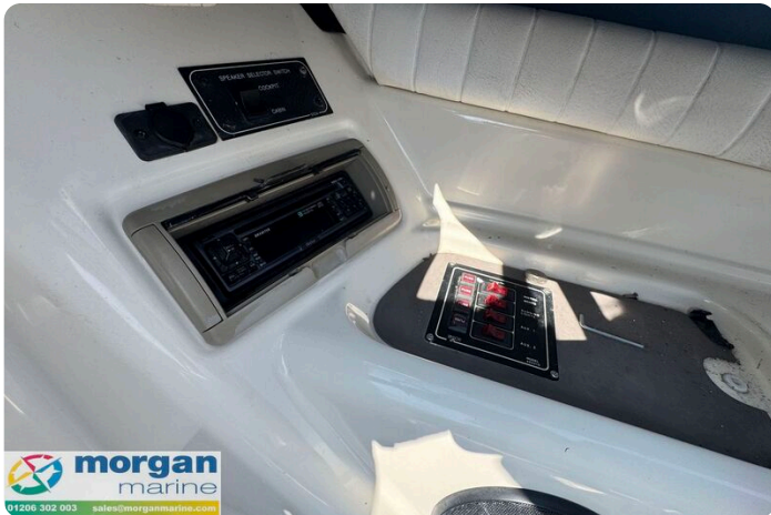
Bayliner 2252 - radio