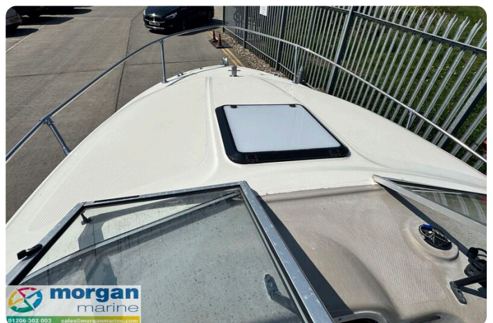
Bayliner 2252 - hatch