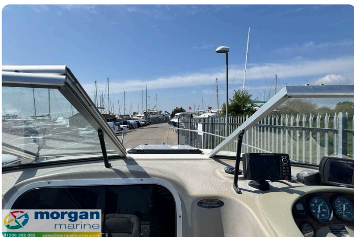
Bayliner 2252 - walk through windscreen