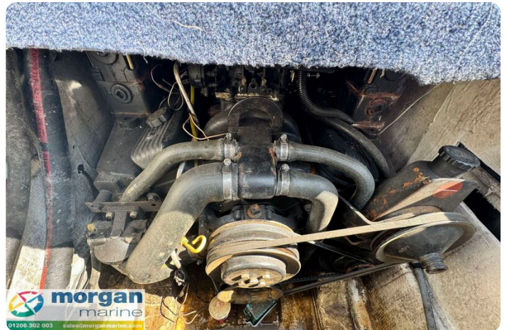
Bayliner 2252 - engine