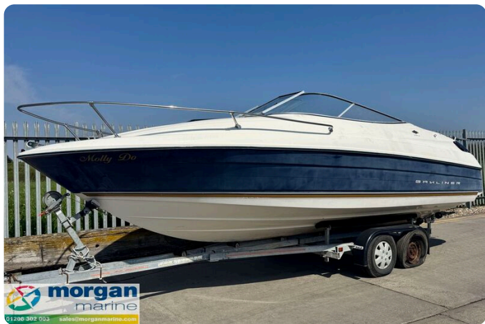
Bayliner 2252 - Main