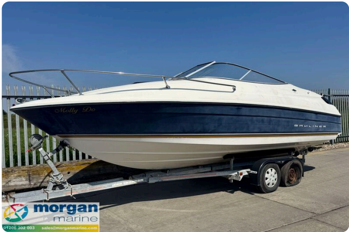
Bayliner 2252 - side view