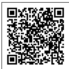
Clipper Marine Ltd