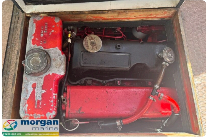
Aquastar 27 -engine