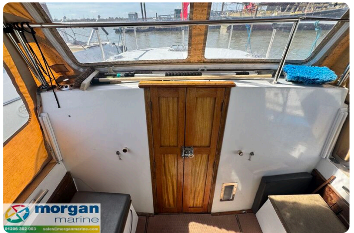
Aquastar 27 - door