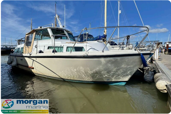
Aquastar 27 - Main