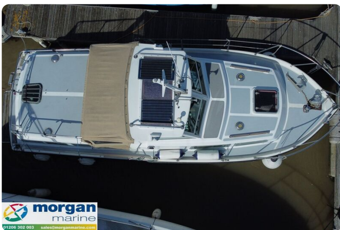
Aquastar 27 - top view