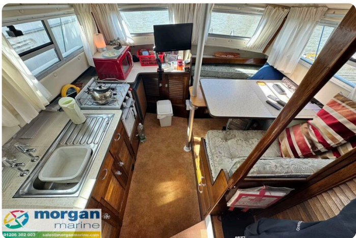
Aquastar 27 -galley