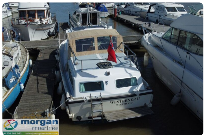
Aquastar 27 - ladder