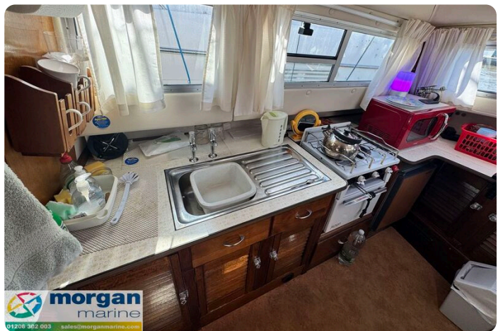
Aquastar 27 - sink