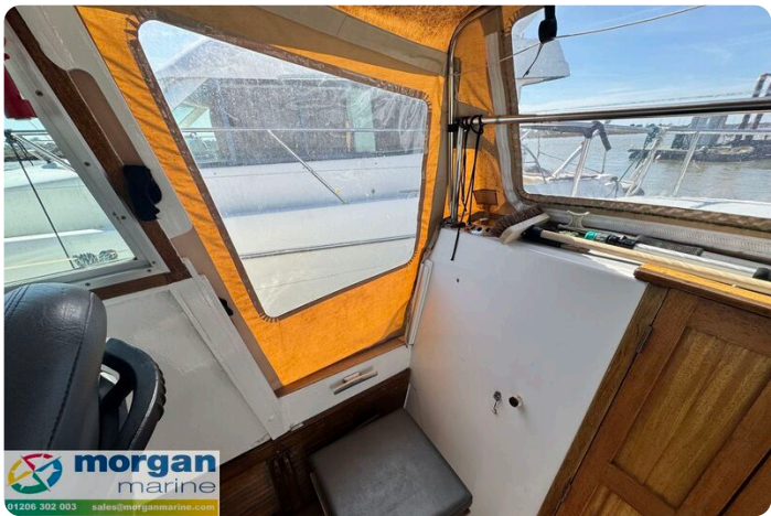
Aquastar 27 - window