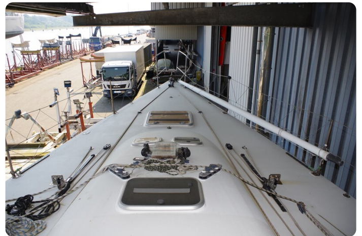
MSP_5245 - Kopie