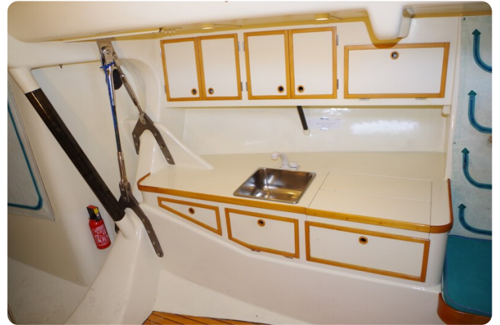
MSP_5304 - Kopie