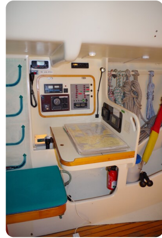
MSP_5277 - Kopie