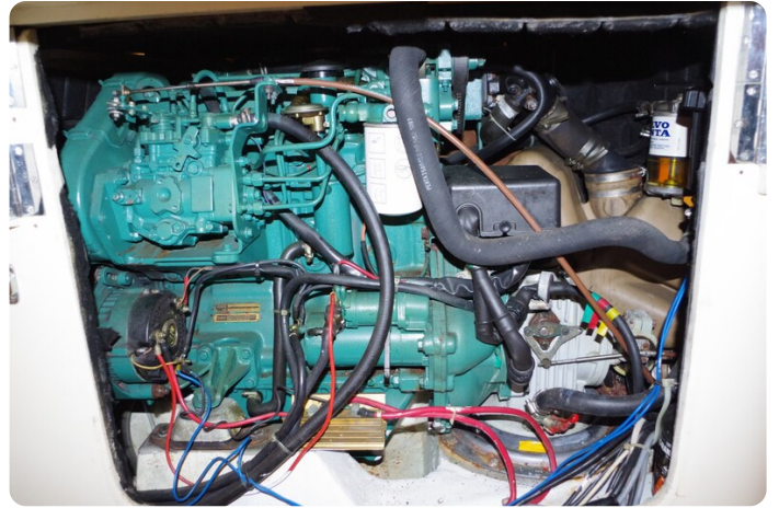
MSP_5286 - Kopie