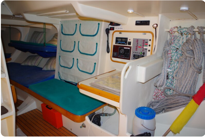
MSP_5276 - Kopie