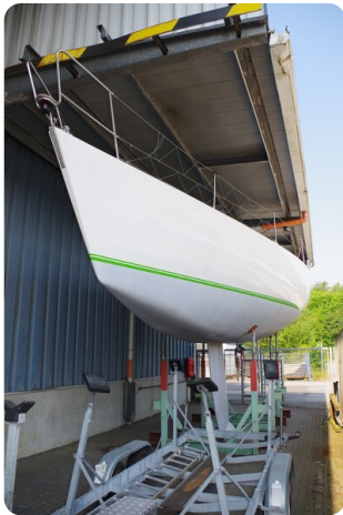
MSP_5232 - Kopie