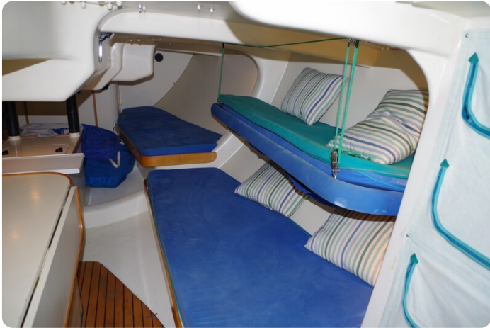
MSP_5271 - Kopie