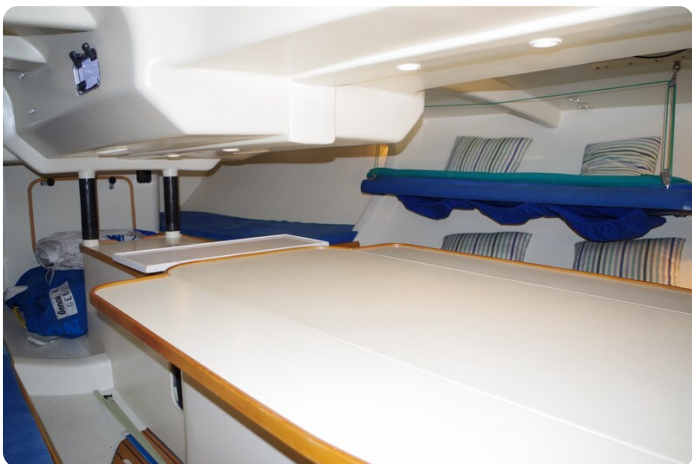
MSP_5280 - Kopie